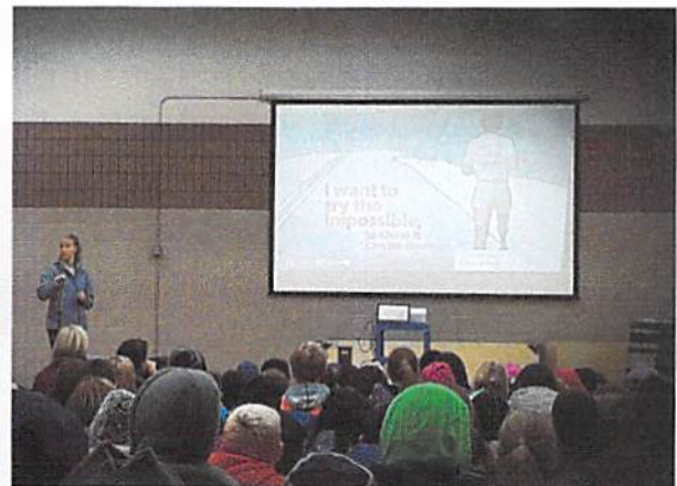
Students gathered for a Terry Fox assembly where our Grade 6 Ukrainian students read Terry's story in English and Ukrainian.